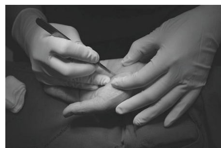
FIGURE 1: The first step for author's surgical technique.

The carpal tunnel operation in this group is female 95%, male 5% with mean age 55.4 years old. Clinical evaluation is shown in Table 2. Most clinical involvement is related to