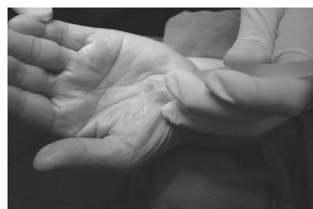
FIGURE 3: The third step for author's surgical technique.

right hand, numbness symptoms, Tinel sign positive, Phalen test positive, and Durkan compression test positive. Operative evaluation is shown in Table 3. Wound scar sizes gradually were reduced in three months. Postoperative evaluation is available for review in Table 4. A minor complication, pillar pain, was found in only one case (6.7%)