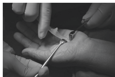
FIGURE 2: The second step for author's surgical technique.