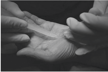
FIGURE 4: The fourth step for author's surgical technique.