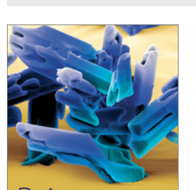
Pain Research and Treatment