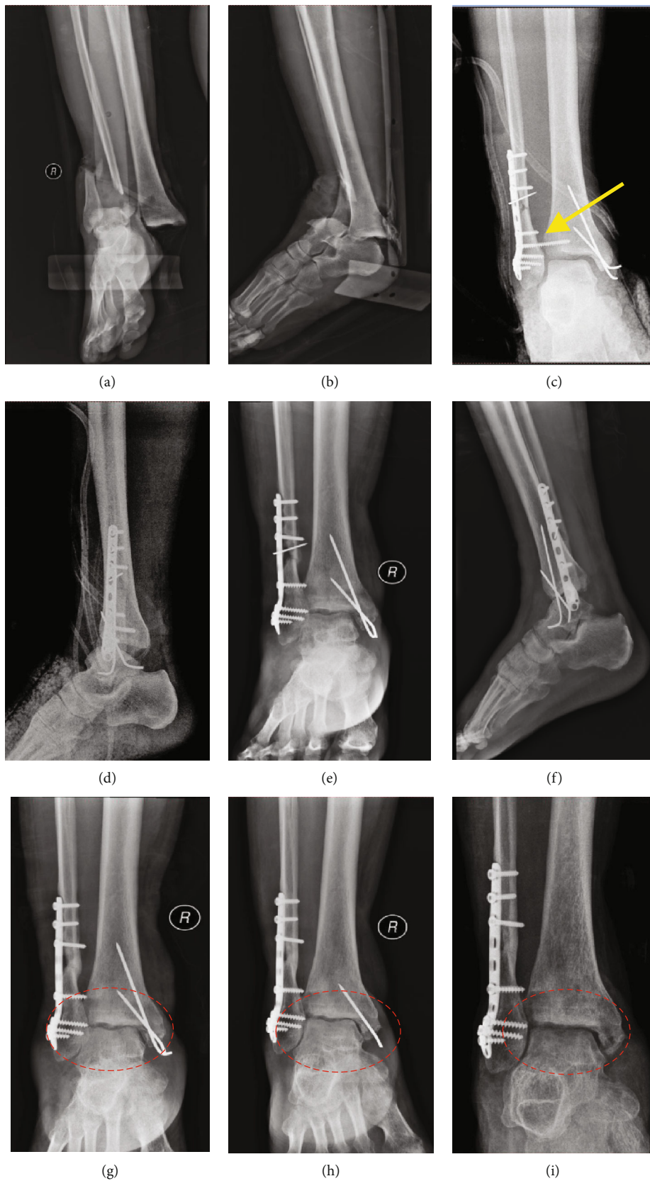
FIGURE 1: Continued.