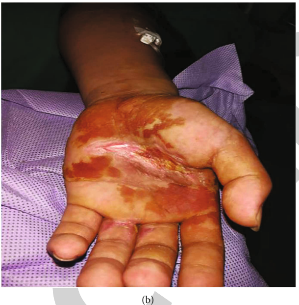
FIGURE 2: An examination of a patient's wound in the insulin therapy group. The patient was a 56-year-old man. His left hand was lacerated (a). Following the debridement of necrotic tissue, there appeared an incision on the palm of the left hand. The granulation tissue developed nicely, and the lesion fully closed after 20 days of local insulin infusion (b).