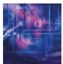
Advances in Mathematical Physics