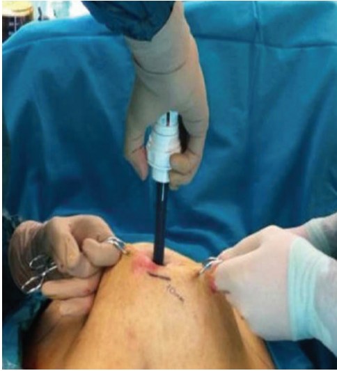
FIGURE 1: Counter traction of the skin edges during trocar insertion.

perforate the fibrosis. The fibrotic tissue was then perforated by a number 11 scalpel and this gate was enlarged by scissors to create a 1 cm free space. Then an 11 mm trocar could be placed with the method as described earlier. Abdominal wall compliance was very low, and pneumoperitoneum could be established with 1.8 liters of carbon dioxide. Additional robotic trocars could be placed in the left subcostal area again by hanging the trocar sites with towel clamps to avoid possible intestinal injury. It was difficult but possible to reach the ligament of Treitz and then to divide the great omentum. A standard gastric bypass was performed successfully. Her postoperative course was uneventful and she was discharged 4 days after surgery.