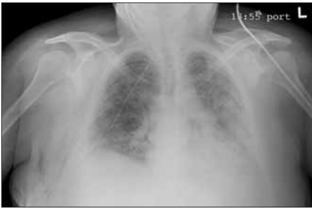
Figure 3) Anteroposterior chest radiograph, following video-assisted thoracoscopic lung biopsy of the right lower lobe, showing extensive bilateral air space opacification

The patient continued to have intermittent fevers and her white blood cell count increased to 18 \times 10^9/L . All cultures were negative. On postoperative day 3, her O_2 saturation decreased further, requiring the initiation of high-fraction face mask O_2 . Exacerbation of NSIP was suspected and she was started on intravenous methylprednisolone but failed to improve. Her respiratory status continued to decline and on postoperative day 13, she required reintubation and transfer to the intensive care unit. Despite sedation, paralysis and attempts at various mechanical ventilatory modes, it was not possible to provide her with adequate oxygenation or ventilation. She died later that same day.