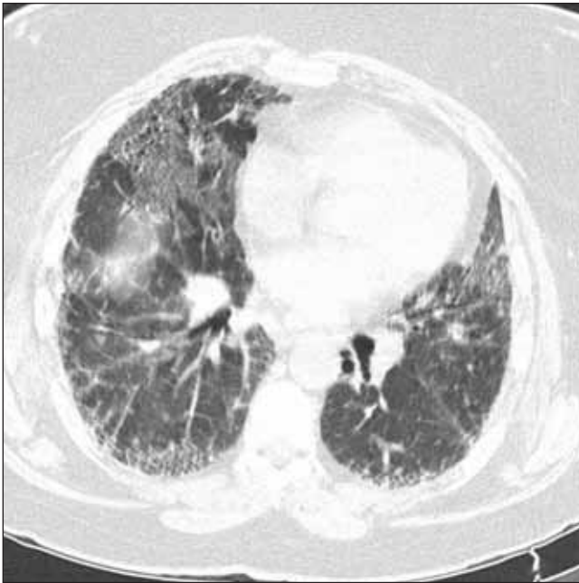
Figure 1) High-resolution computed tomography scan of the patient's chest showing a coarse reticular pattern with honeycombing and ground glass opacification, which is consistent with usual interstitial pneumonia

had advanced clubbing of her fingers and toes. Chest expansion was diminished. Chest auscultation revealed fine inspiratory crackles posteriorly at the bases. Jugular venous pressure was normal. The remainder of the physical examination was unremarkable.