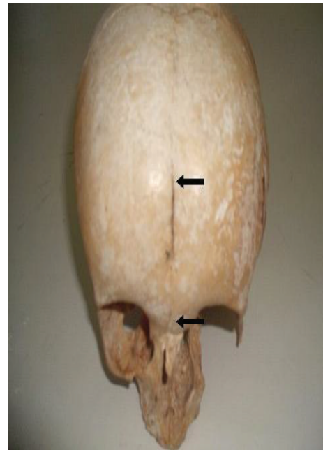
FIGURE 2: Incomplete metopic suture (arrow).

has been reported as occurring between the first year and the beginning of the second year of life [28], before the sixth year [5], in the eighth year [4, 6], or in the tenth year [1]. According to Sant'Ana Castilho et al. [28], there are several causes of failure of the metopic suture to fuse, but genetic influence is currently the factor most accepted by the scientific community.