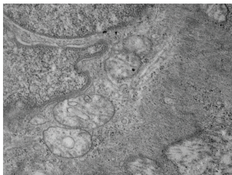
FIGURE 1: Microphotograph of mitochondria of the group with atherogenesis induced for 120 days AI shows mitochondria with disorganized crests, enlarged with clear matrix and variable sizes. They are dispersed and associated with several vesicles (↑).

Activities of citrate synthase and complexes I–IV. Data are means ± SEM: AI versus Ctrl: P < 0.001 ; Ctrl versus AIE: P < 0.01 ; AIE versus AI: P < 0.001 .