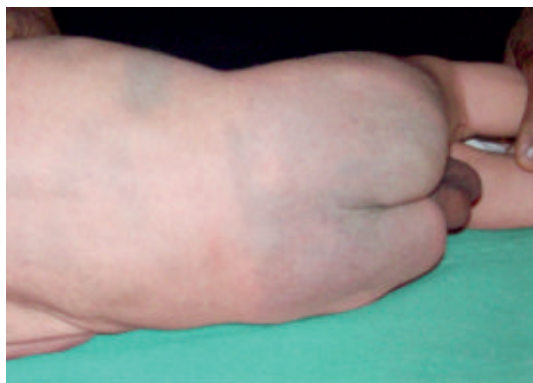
FIGURE 9: Mongolian spot over lumbosacral region.