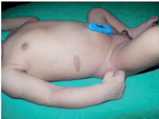
FIGURE 12: Café-au-lait macule.

reported to exert a melanocytic stimulating effect which also causes darkening of linea alba in pregnant women [2].