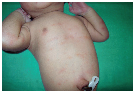
FIGURE 10: Erythema toxicum neonatorum.

Anhidrotic ectodermal dysplasia (Figures 7 and 8) was seen in 1 (0.1%) neonate, where skin biopsy showed absence of sweat glands. Vaginal tags were seen in 18 (1.8%) newborns and cowlicks hair pattern in 2 (0.2%) neonates. One newborn was HIV positive (0.1%) and there was history of maternal varicella in 2 (0.2%) neonates. Twenty (0.2%) newborns were outcome of twin pregnancy in this study.