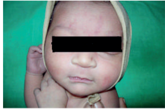
FIGURE 13: Salmon patch.