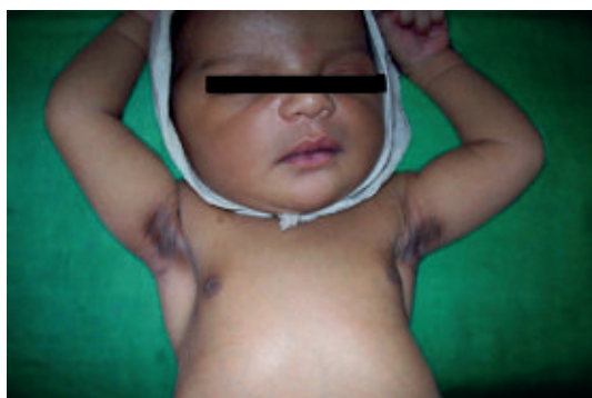
FIGURE 5: Axillary pigmentation.

Among physiological skin lesions, sebaceous gland hyperplasia (Figure 2) was most commonly seen in 894 (89.4%) neonates, among which 428 (47.87%) were females and 466 (52.12%) were males. The most common site of location was nose. Epstein pearls were seen in 891 (89.1%) newborns with 399 (44.78%) females and 492 (55.21%) males. The most common site of location was midline of palate; it was seen over gingiva (Figure 6) in 10 (1.12%) newborns. Mongolian spots (Figure 9) were seen in 847 (84.7%) newborns: 380 (44.86%) females and 467 (55.13%) males; most common site of location was lumbosacral area. It was multiple in 47 (5.54%) newborns. Milia (Figure 4) was seen in 18.3% newborns.