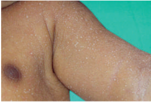
FIGURE 11: Miliaria crystallina.