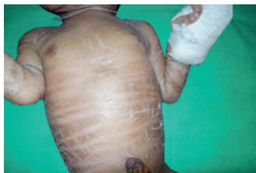
FIGURE 7: Scaling in ectodermal dysplasia.

4 (5.9%) preterm, and 1 (1.5%) postterm neonates. Physiological scaling (Figure 3) was seen in 97 (92.38%) full-term, 5 (4.76%) preterm, and 3 (2.88%) postterm neonates. Distribution of skin lesions with respect to maturity is given in Table 4. Erythema toxicum neonatorum (Figure 10) was the common transient noninfective condition seen in 232 (23.2%) newborns, followed by miliaria crystallina (Figure 11) seen in 30 (3.0%) newborns and eosinophilic pustulosis in 1 (0.1%). Erythema toxicum neonatorum was seen in 107 (46.3%) females and 125 (53.37%) males and this difference was not statistically significant ( P = 0.0947 ). It was seen commonly in 218 full-term (93.96%), 12 (15.17%) preterm, and 2 (0.87%) postterm neonates.