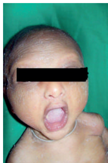
FIGURE 8: Senile changes in ectodermal dysplasia.

Cutaneous signs of spinal dysraphism were seen in 135 (13.5%) newborns. Sacral dimple was most commonly seen in 128 (12.8%) neonates, meningocele in 5 (0.5%), dermoid cyst in 1 (0.1%), and acrochordons in 1 (0.1%) neonate.