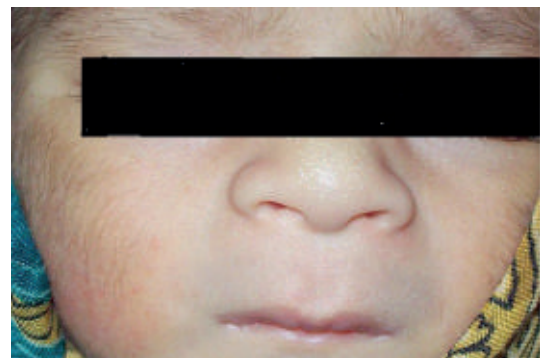
FIGURE 2: Sebaceous gland hyperplasia.

<20 yrs of age, and 30 (3.0%) were in age group >30–35 yrs. The relationship of skin lesions with maternal and neonatal factors is given in Table 1. The frequency of skin lesions in newborns is given in Table 2. Of all the cutaneous lesions in the newborn, physiological skin lesions were more common in 5911 (59.1%), followed by transient noninfective conditions in 263 (26.3%), eczematous eruptions in 13 (1.3%), birthmarks in 241 (24.1%), cutaneous signs of spinal dysraphism in 135 (13.5%), and others in 25 (2.5%).