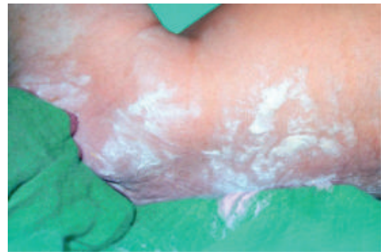
FIGURE 1: Vernix caseosa.