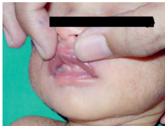
FIGURE 6: Bohn's nodules.

With respect to maturity, all skin lesions were commonly seen in term newborns, compared to preterm and postterm newborns. Vernix caseosa was seen in 62 (92.8%) full-term,