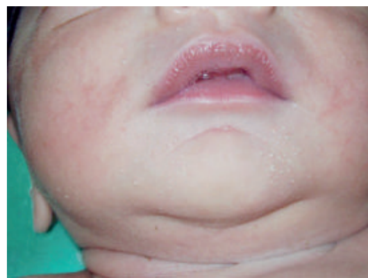
FIGURE 4: Milia.