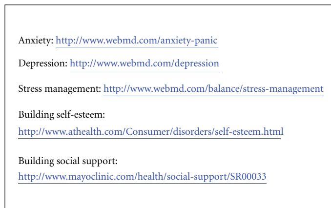
FIGURE 3: Internet resources for nurse educators and nursing students.

spending more time talking with trusted individuals and not isolating oneself. Previous studies have also recommended a variety of ways to improve self-esteem and social support for nursing students [39, 66]. For additional recommendations, see Figure 3 for internet resources on building self-esteem and social support.