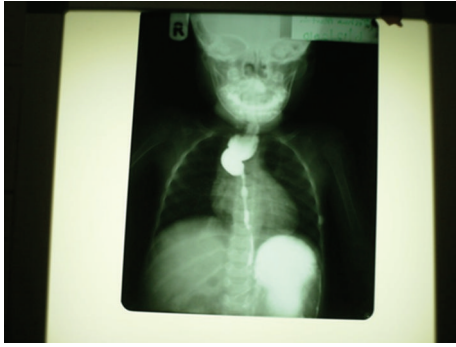
FIGURE 1: Preoperative barium swallow/meal of a child with corrosive oesophageal stricture.