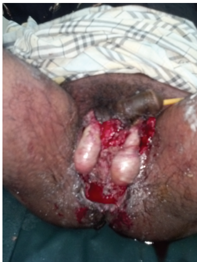
FIGURE 1: Partially debrided Fournier's gangrene.

infection. Diabetes mellitus is reported to be present in 20–70% of patients with FG [4] and chronic alcoholism in 25–50% patients [5]. Any condition with decreased cellular immunity may predispose to the development of Fournier gangrene theoretically. The emergence of HIV into epidemic proportions has opened up a huge population at risk for developing FG [6].