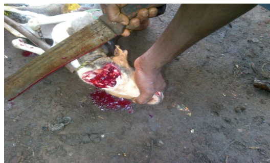
FIGURE 3: Butcher slaughtering dog for meat, using his bare hands to muzzle the mouth.

The 5% prevalence of rabies antigen in the saliva and brains of apparently healthy dogs sold for human consumption in Abia State as demonstrated in this study is also in agreement with that of earlier work. [12] which established that apparently healthy dogs excrete rabies virus in their saliva for long period of time without showing clinical signs. Aghomo and Rupprecht [17] also reported lower prevalence in South Western Nigeria. In the study carried out in Ethiopia (Fekadu, 1975) dog inoculated with rabies virus recovered from clinical