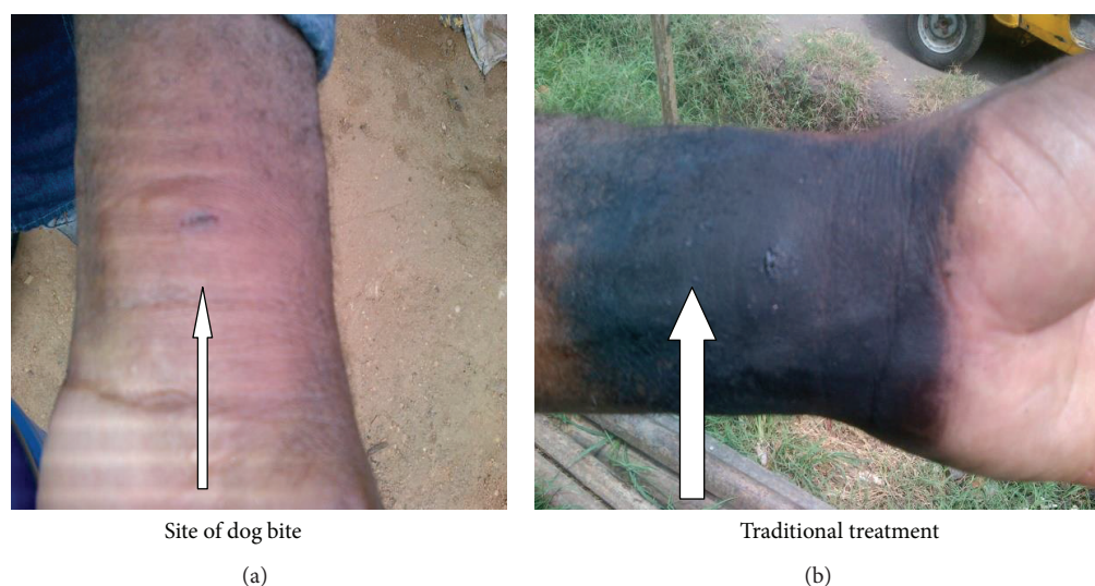
FIGURE 4: Site of dog bite sustained by dog meat processor in Abia state, Nigeria, and traditional treatment.

of rabies [19]. Human deaths from bites by owned dogs have been reported in Nigeria [21].