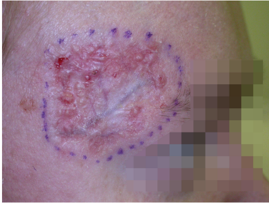
FIGURE 1: Superficial basal cell carcinoma on patient's right forehead, with nodular growth pattern at the periphery.