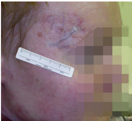
FIGURE 2: The same lesion 4 months after PDT.

therapy (PDT) may potentially be an effective treatment with improved healing and better cosmesis than excision.