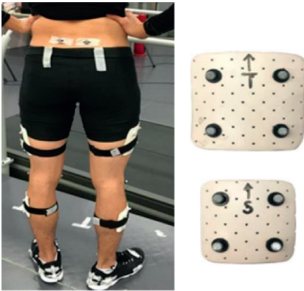
FIGURE 2: Markerset placement.

calcaneus), two foot tracking markers (medial side of first metatarsal head, upper side of second metatarsal head, and lateral side of fifth metatarsal head), and two rigid clusters of four markers that were attached onto the thigh and lower leg. The malleolus and femoral epicondyles markers were captured during static trials and then removed during running trials, as previously reported [8].