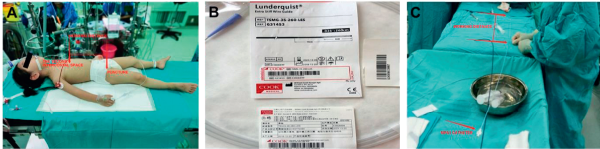
FIGURE 1: Measure the working distance: (a) the working distance is from the second intercostal space to the puncture site; (b) 0.035/260 cm extra stiff wire guide; (c) the MPA1 catheter marks the working distance.