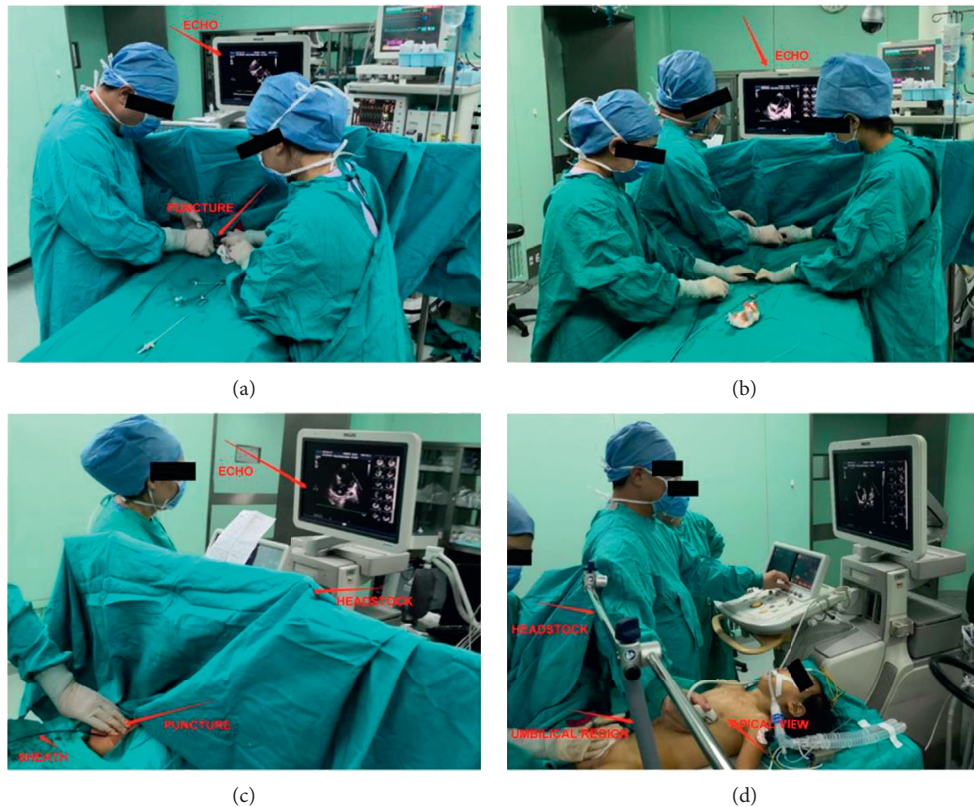
FIGURE 2: Percutaneous device closure of pediatric atrial septal defect through the femoral vein guided by transthoracic echocardiography without radiation: (a) in the operating room without radiological equipment, right femoral vein puncture point; (b, c) procedure under the guidance of transthoracic ultrasound; (d) the headstock (red arrow) and the child's umbilical region (red arrow) are vertically parallel, which can help isolate the surgical area and the ultrasound area.

without radiation or intracardiac echocardiography remains questionable. This manuscript aims to study the procedure guided, only by transthoracic echocardiography. The selection of the sections for the occlusion of the ASD ensures the safety and efficiency of the implementation of this new technology.