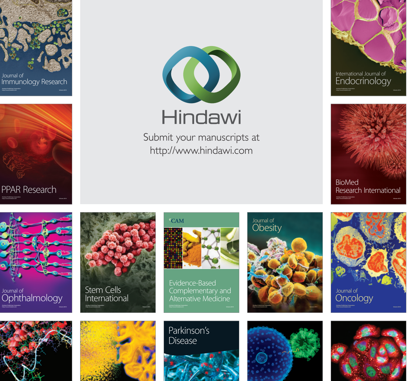
Computational and Mathematical Methods in Medicine