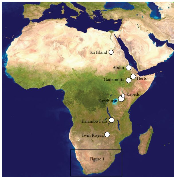
FIGURE 2: Location of the sites discussed in the text.

either Homo erectus or H. rhodesiensis . In contrast, the Florisbad hominin skull (the type specimen of Homo helmei [11]) is associated with a “Florisian Land Mammal Age” (see [8] FLMA; ~780–~10 ka) faunal assemblage and MSA technology and is dated to ~259 ka [12, 13]. The oldest FLMA assemblage comes from Gladysvale Cave at between 780 and 578 ka [14]. Currently, the earliest well-dated Homo sapiens remains come from Omo and Herto in Ethiopia between 198 and 147 ka [15, 16]. In southern Africa, the oldest modern human remains come from Border Cave, Klasies River Mouth, and Pinnacle Point and are all dated to less than 184 ka [17–20]. The Border Cave 1 and 2 remains could be