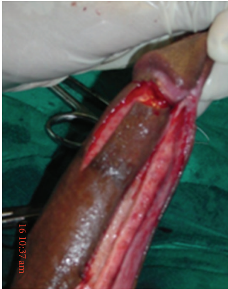
FIGURE 1: Orandi (longitudinal) penile skin flap.