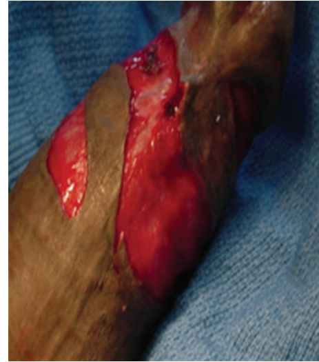
FIGURE 3: Spiral penile skin flap.

were primarily repaired and had ample healthy penile skin with variable flap length, where it was 6 cm in 6 cases subjected to Orandi flap (Figure 1), 7–10 cm in 8 cases with circular fasciocutaneous penile flap (Figure 2), and 10–15 cm in 4 cases with spiral flaps (Figure 3). As regards the technique, the urethra was completely mobilized from the underneath corpora cavernosa and rotated 180 degrees, then, dorsal stricturotomy was done, penile skin flap was applied as a dorsal onlay, and the urethra was fixed to its bed. If penile skin is deficient, U-shaped scrotal flaps were raised for coverage. Indwelling urethral catheter was left for 3 weeks plus suprapubic cystocath. MCUG was performed after catheter removal, if any leakage occurred, cystocath drainage was delayed.