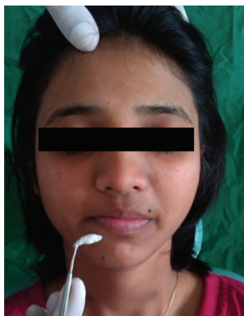
FIGURE 3: Light touch assessment.

2.3. Light Touch Assessment (LT). This method was used for testing by gently touching (tactile stimulation) the skin and evaluating the detection threshold of the patient. For this test, cotton stick was used to perform the test. Stimuli were applied at randomly and area of anesthesia was mapped by moving outward in small steps until stimulus is felt [2] (Figure 3).