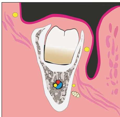
FIGURE 5: Vital structures in relation to the impacted 3rd molar.

nerve injuries, first among which to be introduced in 1943 was Seddon's classification that involves the following three categories.