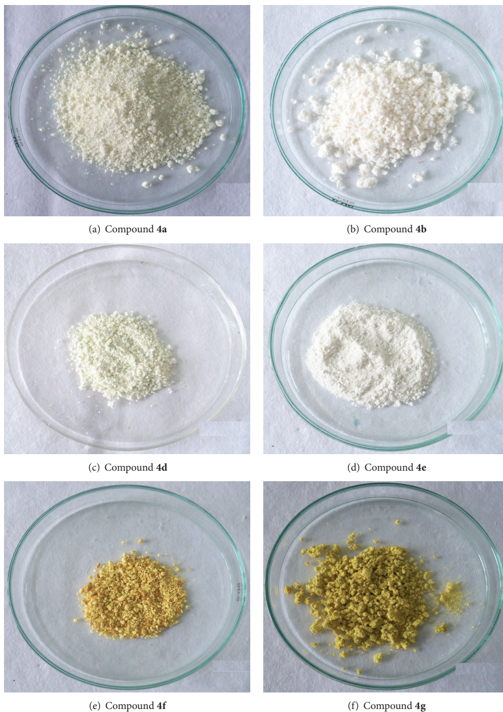
FIGURE 2: Photographs displaying some of the synthesized compounds by microwave irradiation method.

conventional synthesis. And also the reaction time is reduced from 4–8 h to 5–10 min. Microwave synthesis reduced the formation of waste and byproduct. This is particularly relevant for high energy heterocyclic reactions. The predominant use of protic solvents leads to quicker, greener, and therefore more environmentally friendly reaction. The application of MW irradiation technology in MMS significantly enhanced the synthetic yield of thiopyrimidine obtained by consecutive Knoevenagel and Michael addition reactions performed on a