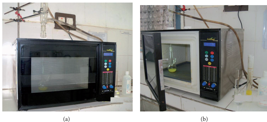
FIGURE 1: Photographs displaying microwave irradiated synthesis of titled compounds.