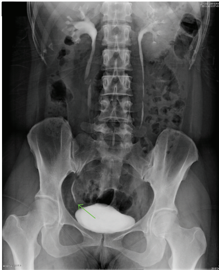
FIGURE 3: Follow-up for the patients posttreatment of 3 months. After removing the double J stent, the standard intravenous pyelography showed the normal right ureter with no obstruction or stricture (indicated as the green arrow). Meanwhile, hydronephrosis in the originally obstructed right kidney was largely or completely reversed.

National Natural Science Foundation of China (81170698, 81370856), and Anhui Provincial Natural Science Foundation (1408085QH180).