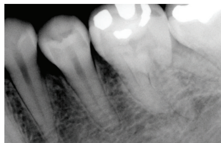
FIGURE 1: Preoperative radiograph showing three separate roots of mandibular first molar.

After obtaining adequate anaesthesia, the tooth was isolated with rubber dam and root canal treatment was initiated. Conventional access cavity preparation was completed. The pulp chamber was irrigated with 3% sodium hypochlorite and carefully examined with an endodontic probe (DG-16, Dentsply, Gloucester, UK). All canals were scouted using K-file number 10 (Dentsply, Maillefer, Ballaigues, Switzerland). Working length was estimated using an apex locator