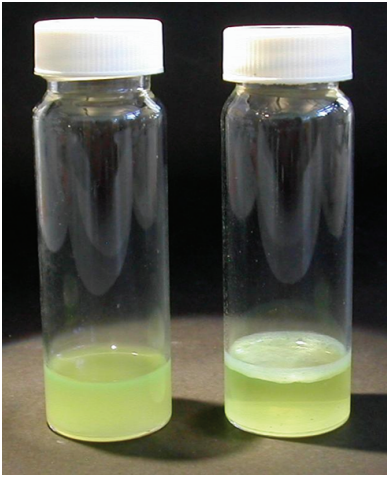
FIGURE 1: Adaptive radiation in static microcosms gives rise to the Wrinkly Spreader with a new niche preference. Shown on the left is a King's B agar plate, incubated for three days at 28°C, spread with a sample taken from a diversified P. fluorescens SBW25 population where both Smooth morphs and Wrinkly Spreader colonies are evident (this plate has seven Smooth colonies each with a rounded circumference and a smooth convex surface, with one positioned at the top of the plate; all of the rest are Wrinkly Spreader colonies which have irregular, multilobed circumferences and a flattened and wrinkled surface). On the right are two static King's B microcosms which were incubated for three days at 28°C. The left microcosm was inoculated with the wild-type or ancestral SBW25 which grows throughout the liquid column, and the right microcosm with the Wrinkly Spreader which colonises the A-L interface through the formation of a robust biofilm.

Although both the ancestral SBW25 and the Wrinkly Spreader can swim using flagella, the successful recruitment of the Wrinkly Spreader probably is the result of altered cell surface charge or relative hydrophobicity [54], and once located at the meniscus region close to the vial walls, Wrinkly Spreader cells also show a higher level of attachment than the ancestral SBW25 [51, 54]. In this system, SBW25 populations are altering their environment through niche construction, and these changes feedback to influence the subsequent evolution of the Wrinkly Spreaders through ecoevolutionary (ecological-evolutionary) feedbacks where the time scales of environmental change and evolution are similar [55, 56] (see the timeline of events in the diversification of SBW25 populations in static microcosms leading to the rise of the Wrinkly Spreaders in Figure 2).