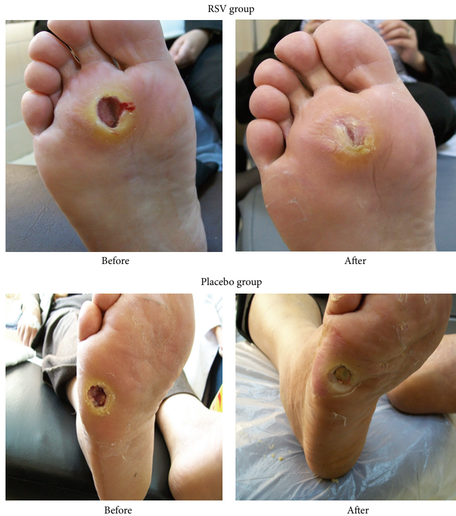
FIGURE 2: Ulcer images before and after 60-day resveratrol or placebo treatment.