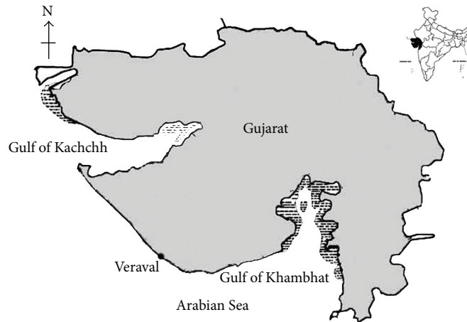
FIGURE 1: Map showing the study location along the South Saurashtra coastline off Arabian Sea. The Veraval coast was subdivided into five microsampling sites.