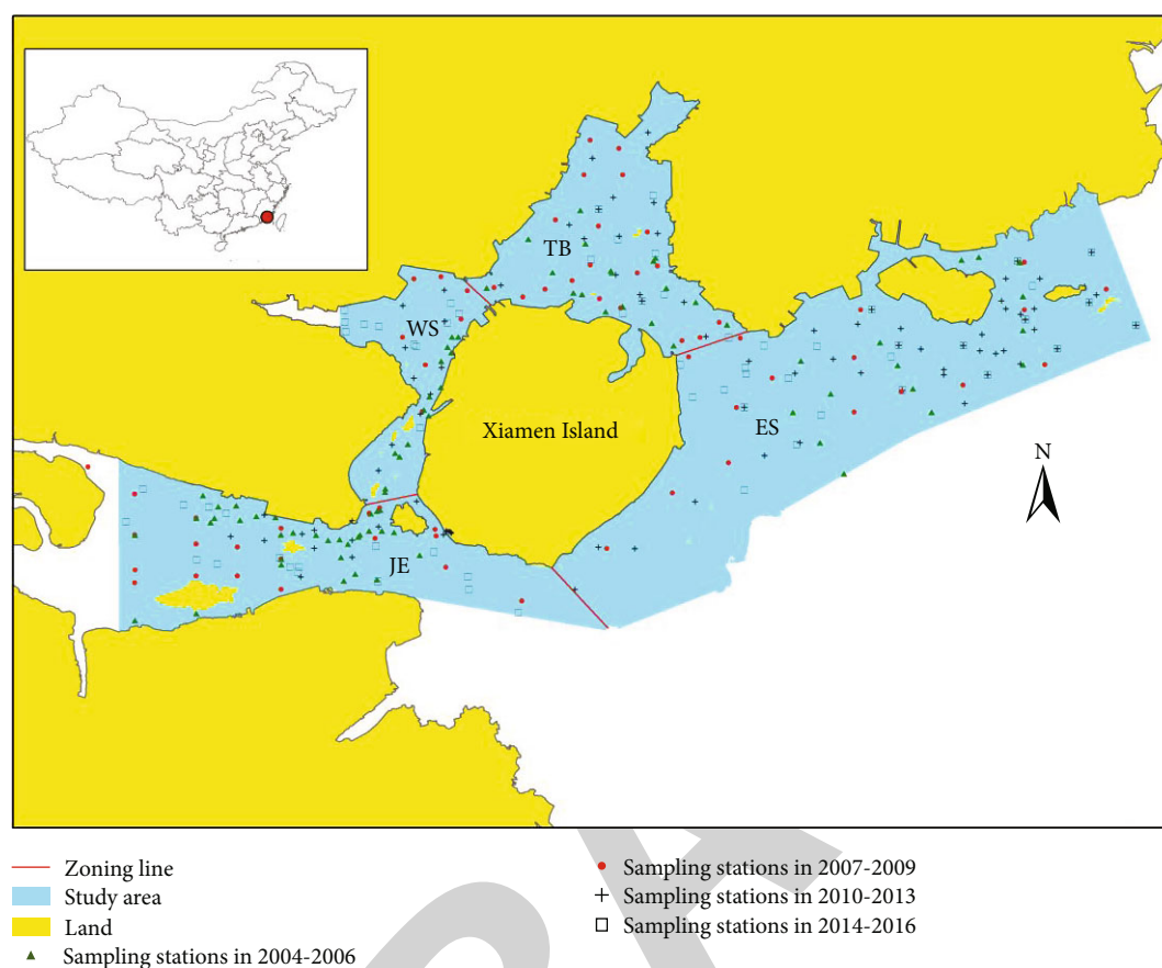
FIGURE 1: Study area and the sampling stations in 2004-2006, 2007-2009, 2010-2013, and 2014-2016. WS: the West Sea area; JE: the Jiulong River Estuary; ES: the East Sea area; TB: the Tong'an Bay.

2004-2016, analyzes the spatial distribution characteristics and temporal changes of total organic carbon (TOC), oils, sulfide, and heavy metals and their pollution levels and discusses the resources of pollutants. The study analyzes the spatiotemporal changes of sediment quality of Xiamen Sea area in four different periods (2004-2006, 2007-2009, 2010-2013, and 2014-2016), the first time ever, and provides pollution factors, pollution severity and distribution scope of surface sediments in different periods, which can be referred to for further understanding the sediment pollution status in Xiamen Sea area and the focus of monitoring afterwards and pollution control. Also, this study is helpful for studying other sea areas.