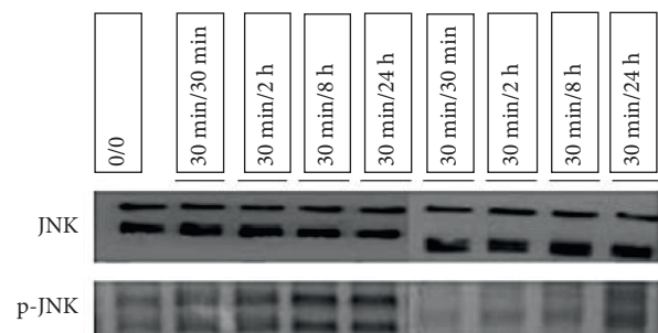
FIGURE 3: Western blot detection of p-JNK and JNK expression in spinal cord tissue.

Spinal cord reperfusion injury as a secondary damage after primary spinal cord injury is an important factor causing nerve cell damage, and the mechanism of injury is multifactorial, with possible mechanisms including ionic environment, oxygen-free radicals, and excitatory amino acids [17]. The MAPK signaling pathway exists in eukaryotic cells and is able to transduce different stimulatory signals from extracellular to nucleus, causing cell proliferation or apoptosis, and is widely used in the study of cell signaling. JNK was first discovered in 1993 by Hibi et al. [2] and is an important member of the MAPK family of serine/threonine protein kinase pathways, which have been shown to be