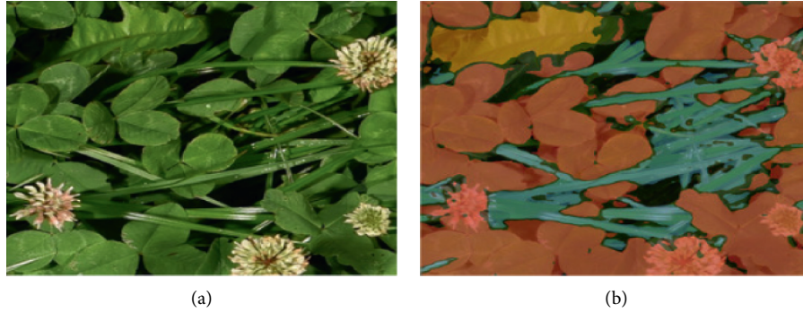
FIGURE 1: Example of the image analysis on a real image. Each pixel in the image is automatically analyzed and classified as either grass (blue), clover (red), weeds (yellow), or unidentified (black overlay). (a) Example input image. (b) Automatically analyzed image [21].