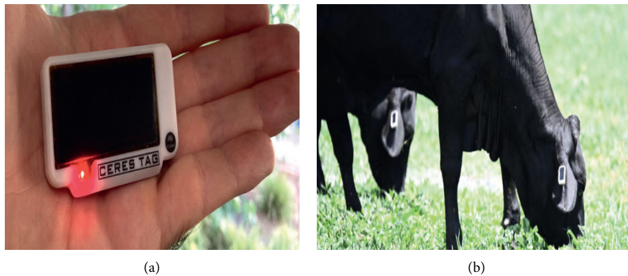
FIGURE 2: Sensor (a) and sensor applied to grazing stock (b).

intake using sensors that match ear tags (Figure 2). Livestock grazing is a common feature of pasture-based livestock. Hence, it is vital to monitor such features in order to assess the welfare status of animals and the pasture for subsequent management. In addition, studies indicate algorithms that predict pasture intake by individual cattle based on behaviors quantified from the sensor data.