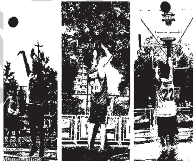
FIGURE 2: Image processing results.

elimination proposed in this article has the highest accuracy and the best trajectory capture effect.