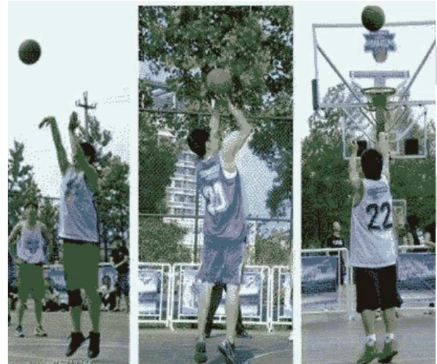
FIGURE 1: Original shooting image of athletes.

According to Figure 3, the accuracy of basketball shooting trajectory automatic capture algorithm based on background elimination proposed in this article can reach 100%, while the accuracy of basketball shooting trajectory automatic capture algorithm based on inertial sensor proposed in literature [5] is only 86%, and in literature [6], the proposed algorithm of determining object position and predicting motion trajectory based on binocular vision has the highest accuracy of only 80%. The automatic basketball shooting trajectory capture algorithm based on background