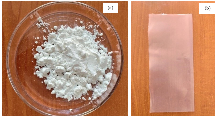
FIGURE 2: The starch extracted from ASS (a) and the developed edible film prepared from ASS (b).