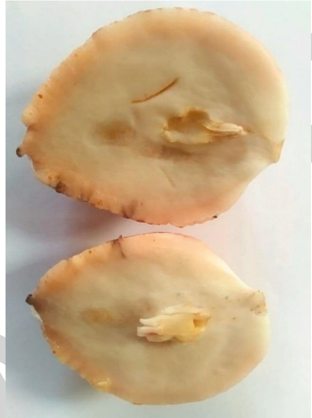
FIGURE 1: Avocado ( Persea americana ) seed.

2.3. Preparation of Edible Films. The formulation solutions to prepare the film were formulated with different combinations of agar (0.5–1.0 g), sorbitol (0.5–1.0 ml), Tween-20 (0.1–0.5 ml), and ASS (1–3 g). Casting is one of the well-recognized methods for edible film preparation. This method was adopted to develop the films by following the method specified by Sundramurthy et al. [16]. The developed clear films were carefully detached from the Petri dishes; further, they were equilibrated at 25^\circ\text{C} with 57% relative humidity for 3 days before the experimental investigations.