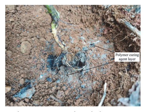
FIGURE 6: Plant roots passing through the curing agent layer.