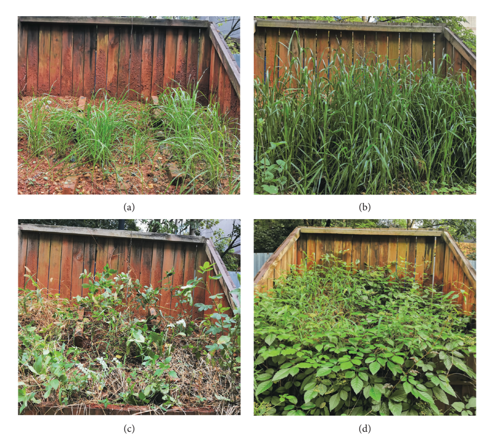
FIGURE 5: Plant growth on the simulated slope: (a) model box A after three months of construction; (b) model box B after three months of construction; (c) model box A after six months of construction; (d) model box B after six months of construction.