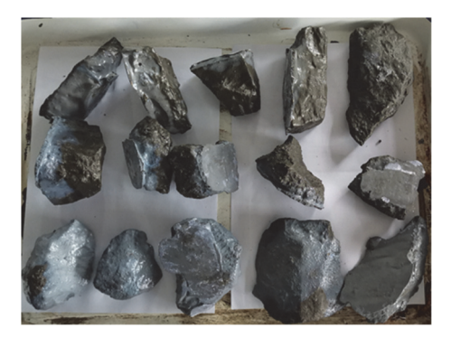
FIGURE 2: Coal gangue specimens coated with pure acrylic emulsion curing agent.