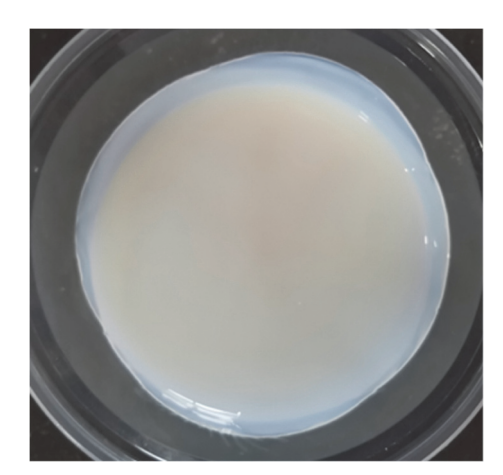
FIGURE 1: Pure acrylic emulsion.