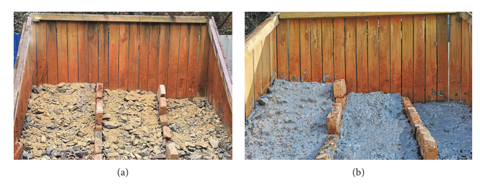
FIGURE 4: (a) Model box A after the laid coal gangue; (b) model box B after spraying the pure acrylic emulsion curing agent.