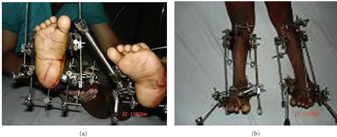
FIGURE 3: Clinical photos showing the fixator assembly in position before ligamentotaxis is started.

average difference in the calf size of affected side and normal side was 1.0 cm while the calf size was same in bilateral cases. The calf size remain unaffected by the procedure.