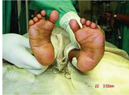
FIGURE 1: Clinical photo showing deformities in both feet.

We operated all our patients in general anaesthesia. After putting all the K-wires (i.e., 3 each tibial, calcaneal, and metatarsal), we tried to correct the deformity by standard Ponseti method and then maintained whatever reduction we achieve, by completing the frame by connecting the tibial, calcaneal, and metatarsal attachments. One each distractor was placed on both side between tibial-calcaneal and calcaneal-metatarsal attachments. The cavus, if any, was corrected by subcutaneous tenotomy. The distraction was started on the third postoperative day in standard manner, that is, 0.25 mm four times a day on the medial side while 0.25 mm two times a day on the lateral side. We continued this gradual fractional distraction till we achieve the clinical overcorrection (Figure 1, 2, 3, 4, and 5). At this point we removed the fixator and again radiological assessment was done. Podograms were also obtained (and FBA was measured). Then the measurements for corrected shoes and/or D B splint were taken and AKPOP in overcorrected position was given for next 02 weeks. After the 02 weeks we gave orthosis and/or splint and patients were followed up regularly. The importance of bracing was emphasized to the parents and they were advised to comply strictly with the bracing protocol. At the end of 06 months, 12 months, 18 months, and 24 months, all clinical assessments