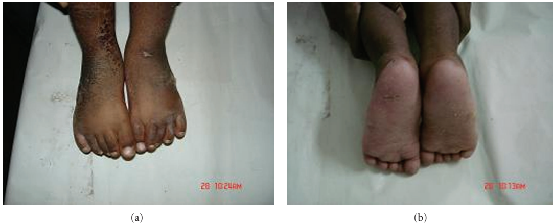
FIGURE 4: Clinical photos showing correction of deformities achieved by ligamentotaxis.