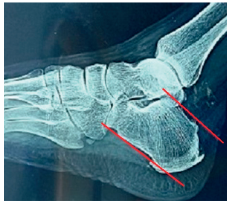
FIGURE 6: Adequate endoscopic resection of the bone with no prominence above the parallel pitch line (red line) at the 4-year postoperative follow-up.