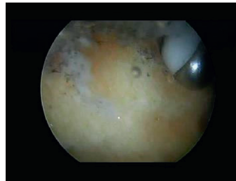
FIGURE 4: Clearance of the soft tissue to facilitate the resection of the bony prominence using a radiofrequency ablation device.

The AOFAS ankle-hindfoot score increased from 55.7 \pm 9.3 (37–68) preoperatively to 94.3 \pm 7.1 (72–100) postoperatively with statistically significant improvement ( P < 0.00001 ) at the final follow-up. According to AOFAS, 12 patients had excellent (90–100 points), 4 good (80–89 points), and 1 fair (70–79 points) clinical results, respectively.