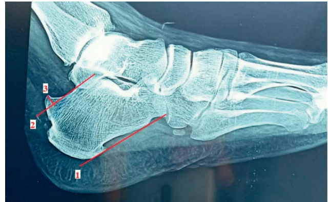
FIGURE 1: Length of bony exostosis is measured on lateral X-ray view of the calcaneus. Line 1 starts from the most inferior point of the calcaneocuboid along the plantar aspect of the calcaneus. Line 2 extends from the highest point of the subtalar and is parallel to line 1. Line 3 indicates the length of the bony hump above line 2.

N : number, SD: standard deviation, and %: percent. Numerical data are presented as mean \pm SD (range) and percentage.