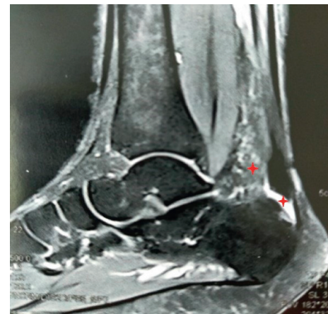
FIGURE 2: Magnetic resonance imaging T 2 sequence, sagittal view showing an increased signal intensity of the retrocalcaneal bursa with marked fibrosis anterior to the Achilles tendon (red asterisks).