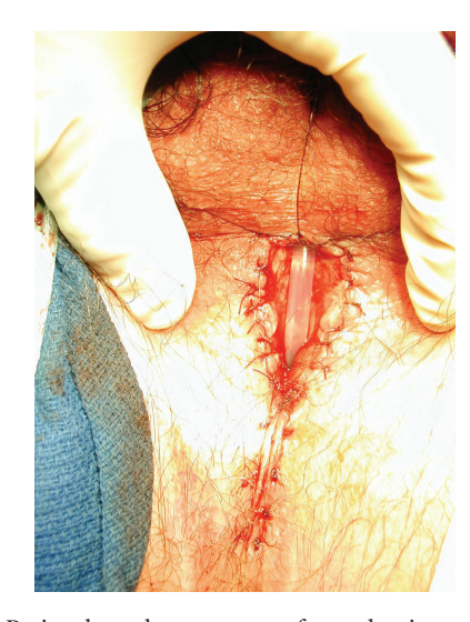
FIGURE 4: Perineal urethrostomy, performed using our suggested "side-to-side" technique.

Penile urethra was involved in all cases, and bulbar urethra was involved in 5/9. The stricture length ranged from 1 to 17 cm (mean, 10.3 cm) (see Figure 2, Table 1)