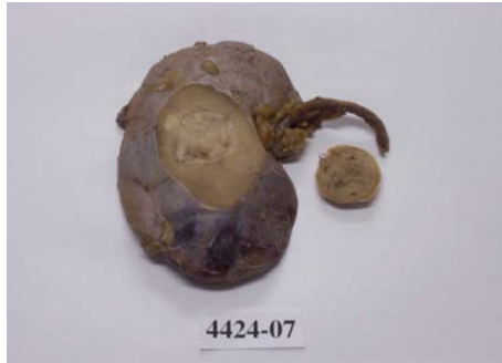
FIGURE 2: Macroscopic examination shows a well circumscribed renal tumour mass. Reprinted from [19] with permission of the Editor-in-Chief of Saudi Journal of Kidney Diseases and Transplant on behalf of the editorial board.

It is important to note that the drawback for SRS is that normal renal uptake of the tracer material used in the evaluation of a primary renal carcinoid may obscure some lesions [7].