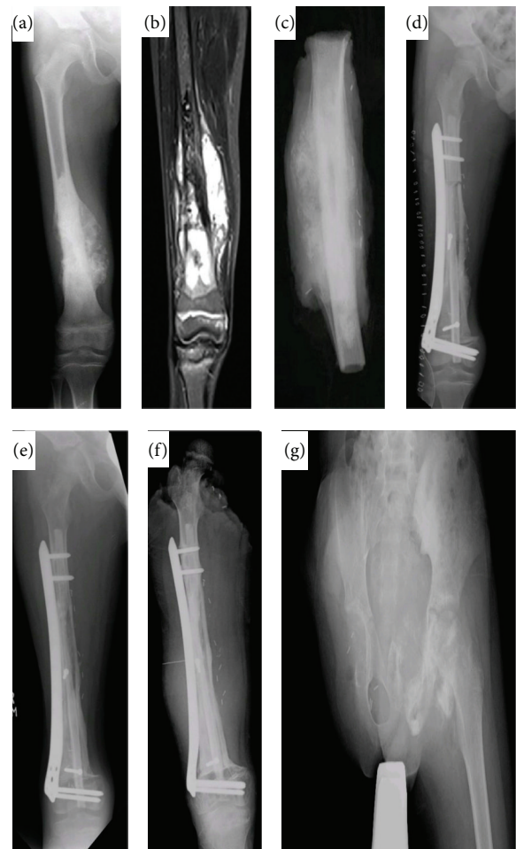
FIGURE 1: A 10-year-old boy with osteogenic sarcoma. (a) X-ray shows lytic mass in right distal femur. (b) MRI shows osteoid lesion in the metadiaphyseal region of right distal femur. (c) X-ray of the resected bone. (d) Immediate postoperative X-ray. (e) X-ray shows graft and host union at both proximal and distal ends 10 months post-operatively. (f) 3-year postoperative X-ray shows local recurrence. (g) X-ray after disarticulation of right hip.

Primary advantages of autoclaved reimplants are that the implanted bone segment is a "custom fit" being the patient's, own bone; no bone banking techniques, costs, immunological response, or transmission risks are involved; and they provide anatomical reattachment of muscles and tendons and natural joint preservation, with a higher incidence of incorporation and peripheral healing than allografts [24].