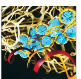
Molecular Biology International