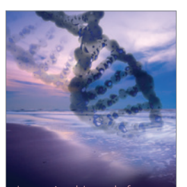
International Journal of Evolutionary Biology