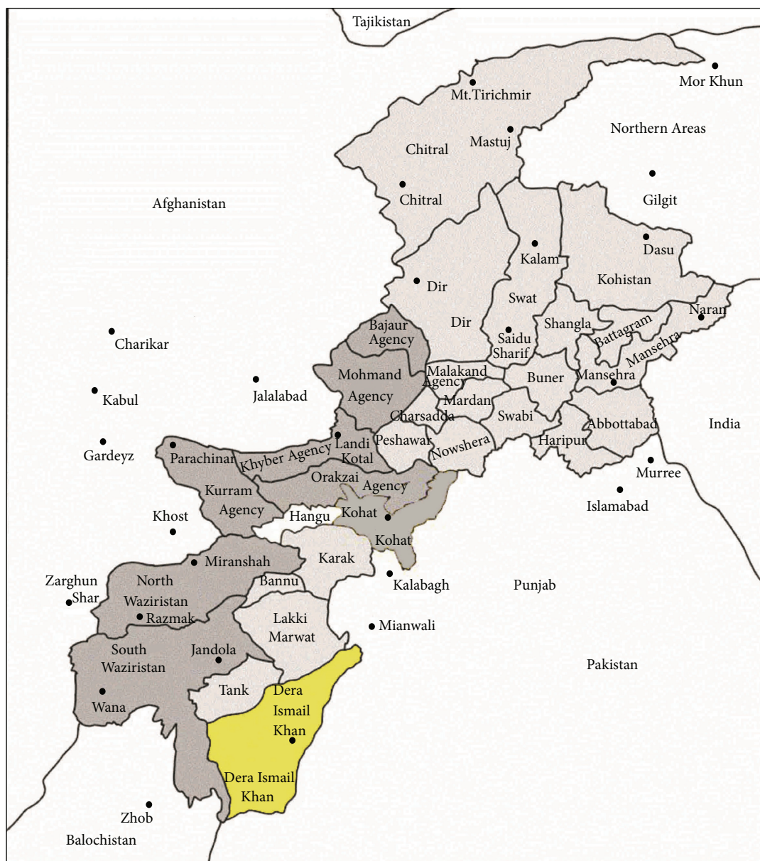
FIGURE 1: Map of the study area.

2.3. Data Quality Assurance. During data collection each respondent was visited or contacted at least three times for the validity of information provided by them. In case of any deviation of respondent idea from the original information provided, it was rejected and considered irrelevant information. Only relevant information was subjected to further analysis process. Further data quality was ensured through proper training of data collectors, pointing out missing information, duplication of material, and careful analysis.