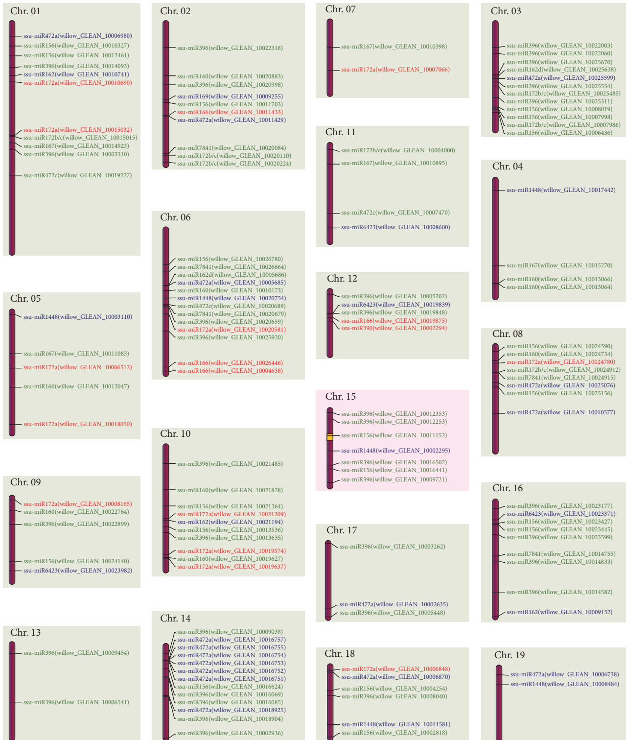
FIGURE 2: Distribution of miRNA targets on 19 chromosomes of S. suchowensis . Thirty target genes regulated by miRNAs commonly presented in both the female and the male flower buds are shown with blue, whereas 17 and 84 genes regulated by miRNAs presented exclusively in the female or the male are shown with red and green, respectively. In addition, the yellow block in chromosome XV represents gender locus in sex chromosome of S. suchowensis .