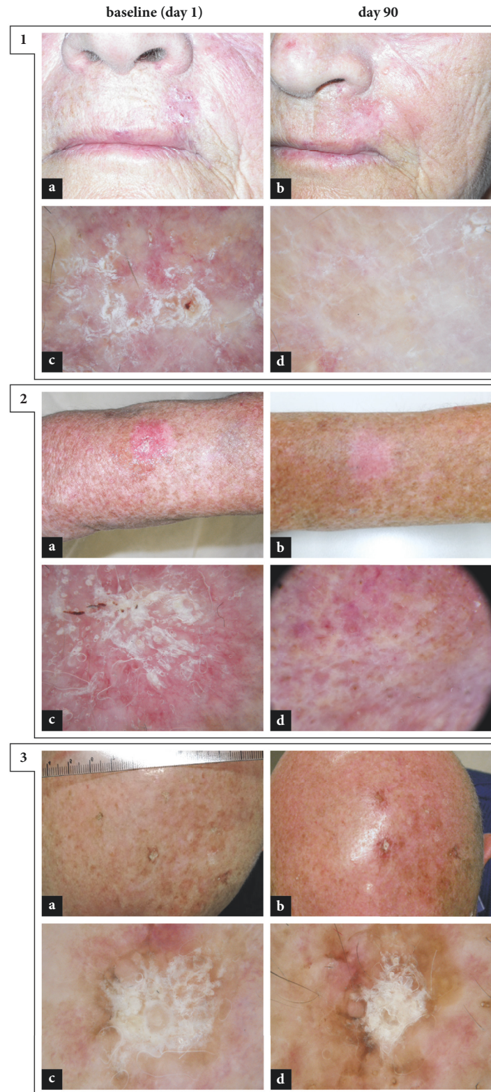
FIGURE 2: Different response-to-therapy rates on the basis of the treated anatomical sites. 1: complete response to therapy in a patient with AK on left upper prolabium. Clinical grade decreased from III (a, pretreatment) to 0 (b, posttreatment); dermoscopic grade decreased from III (c, pretreatment) to 0 (d, posttreatment). 2: complete response to therapy in a patient with AK on left forearm. Clinical grade decreased from III (a, pretreatment) to 0 (b, posttreatment); dermoscopic grade decreased from III (c, pretreatment) to I (d, posttreatment). 3: lack of response to therapy in a patient with AK on the scalp. Clinical and dermoscopic grade remained stable at III (a-c, pretreatment; b-d, posttreatment).