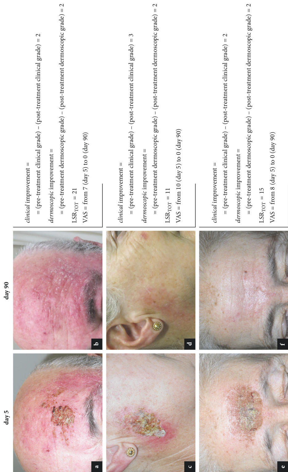
FIGURE 3: Local skin reactions, pain during treatment, and clinical and dermoscopic improvement. Severe local skin reactions (a) and subsequent partial response to therapy (b) in a patient with AK on left frontotemporal region. Mild local skin reactions (c) and subsequent complete response to therapy (d) in a patient with AK on right preauricular region. Severe local skin reactions (e) and subsequent complete response to therapy (f) in a patient with AK on frontal region.