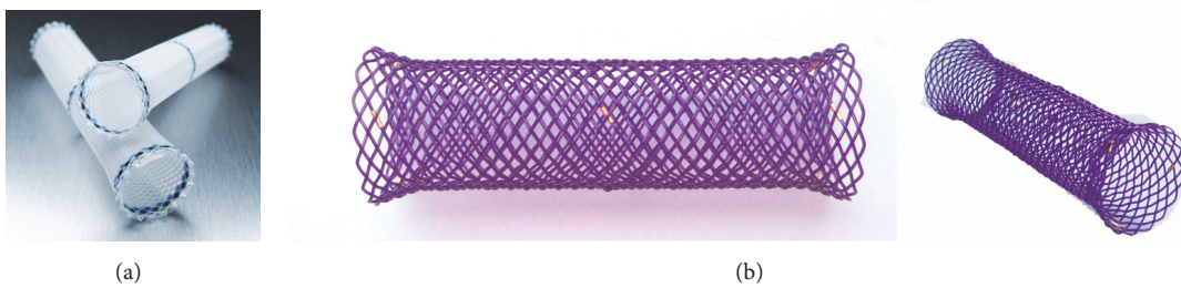
FIGURE 2: Photographs (from the company official websites) show the self-expanding plastic Polyflex stent (Boston Scientific, USA) (a) and SX-ELLA degradable esophageal stent (ELLA-CS, s.r.o. Czech Republic) (b).