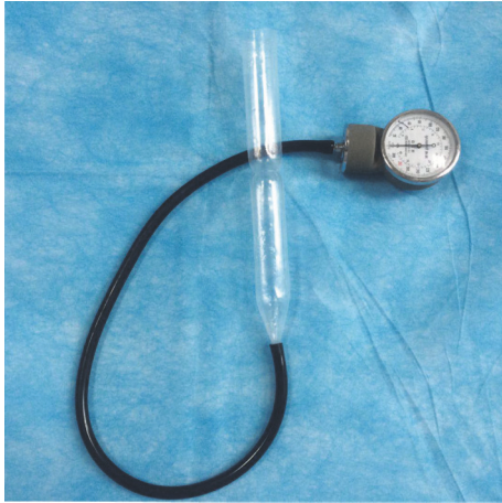
FIGURE 1: Handmade pressure monitoring device.

few studies comparing diagnostic sensitivity in the traditional and modified Valsalva maneuvers. Thus, the aim of this research was to compare the sensitivity and specificity of the traditional and modified Valsalva maneuvers in the detection of PFO-RLS when c-TEE was used as a gold standard.