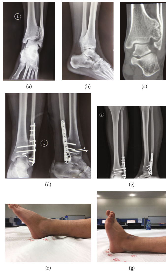
FIGURE 2: Preoperative ((a) anteroposterior; (b) lateral; (c) CT scan with one layer) and postoperative ((d) day 1 after surgery; (e) 6 weeks after surgery, the Kirschner wires have been removed) radiographs from a 32-year-old man. It is noted that the posterior tibial osteotomy was used to retract the Volkmann tuberosity, which was reduced back anatomically to preserve the inferior tibiofibular syndesmosis intact. The lateral photograph at the final follow-up showed good range of motion of ankle joint (FnnG).

are thought to be derived from the periosteum with small cartilaginous nodules. Even osteochondromas are asymptomatic when they are discovered occasionally, progressive enlargement may still give rise to side effect including skeletal deformity, nerve compression, pathological fracture, etc. Therefore, it has been acknowledged that excision of the tumor is recommended for those who are symptomatic or have potential damage in the surrounding tissues. The aim of the surgical treatment is to prevent the pathological fracture, correct ankle deformity, eliminate the possibility of malignant transformation, and improve the symptoms [5]. However, increasing concerns have emerged considering that resection of the lesion may lead to the disruption of the equilibrium that have been already established between the lesion and the ankle, giving rise to the unbalanced mechanics and instability of the ankle joint. More importantly, the inferior syndesmosis plays an important role in stability for the ankle