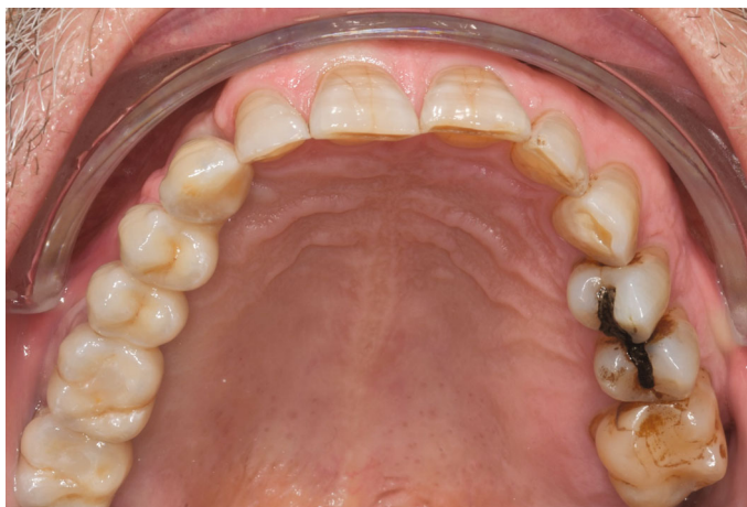
FIGURE 4: Occlusal view of the restoration after the placement.