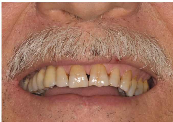
FIGURE 5: Extraoral view at the 3-year follow-up.

Full-contoured prostheses were made of acrylic resin and tried in intraorally.