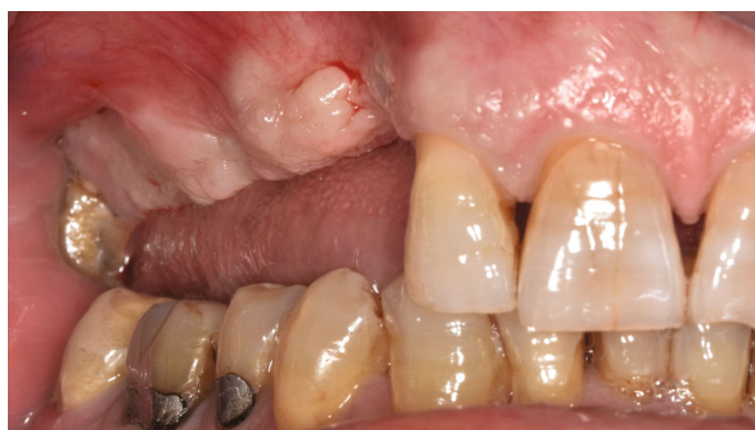
FIGURE 2: Initial situation before the implant placement.