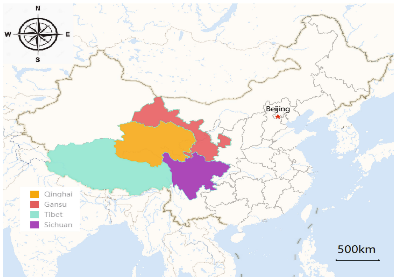
FIGURE 1: Geographic distribution of the yaks enrolled in the study.