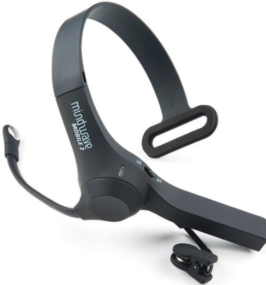
FIGURE 2: Single-channel Neurosky Mindwave Mobile 2.