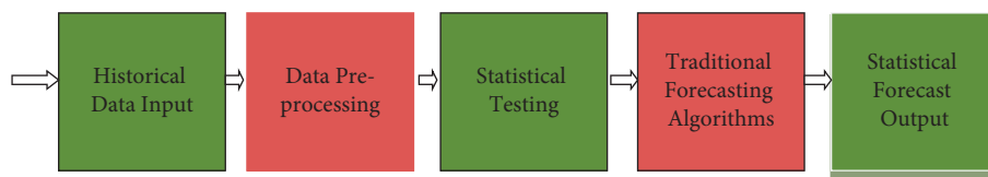
FIGURE 1: The traditional forecasting approach [41].

produced compared to that of the traditional method shown in Figure 1.