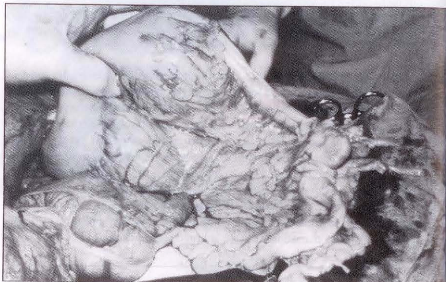
Figure 2) Exposed colon at laparotomy showing the junction between the distal normal colon and the dilated segment which shows absence of taenia coli. The cecum is seen in the lower left of the picture and shows normal muscle wall with taenia coli visible

and was irregularly and haphazardly distributed without its normal layering into circular and longitudinal elements. This appearance was present throughout the dilated segment but the normal anatomical arrangement was seen both proximally and distally. The diverticulum was seen to be of full thickness with normal muscle layers and nerve elements. The patient's postoperative recovery was uneventful and she remains asymptomatic five years later with a normal clinical and radiological follow-up.